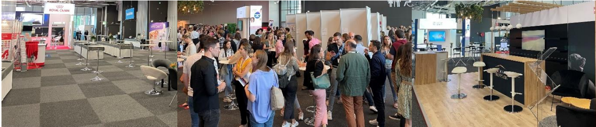
Some of the lecture rooms: